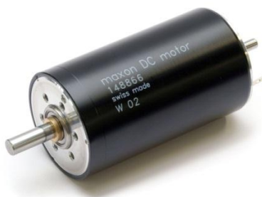
Fig. 2: Ten DC RE 40 maxon motors per exoskeleton ensure smooth movements. © 2011 maxon motor

Rex Bionics chose to use the high-quality maxon motors for a good reason: Rex is a highly sensitive medical product and the safety of the users is of utmost importance. The largest challenge, where the motors are concerned, was uniting quality, size and power in a single product. Currently Rex is being used by approx. 18 persons in New Zealand, with new users joining this group every month. They can all share the feelings of Mitch Brogan: "My cheeks were aching from my constant smiling and I knew that my life has changed forever."