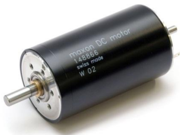
Fig. 2: Ten DC RE 40 maxon motors per exoskeleton ensure smooth movements.

Rex Bionics chose to use the high-quality maxon motors for a good reason: Rex is a highly sensitive medical product and the safety of the users is of utmost importance. The largest challenge, where the motors are concerned, was uniting quality, size and power in a single product. Currently Rex is being used by approx. 18 persons in New Zealand, with new users joining this group every month. They can all share the feelings of Mitch Brogan: "My cheeks were aching from my constant smiling and I knew that my life has changed forever."